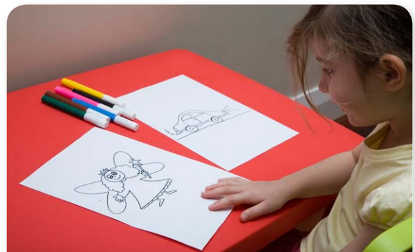
Choose pictures that interest your child