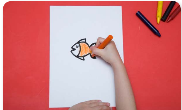
Smaller pictures or pictures with small sections are easier to colour