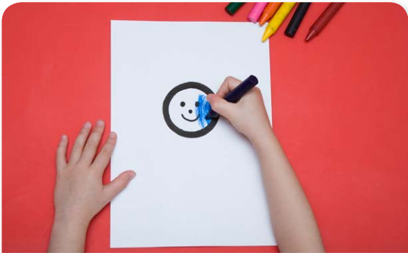
Start with simple pictures with thick lines