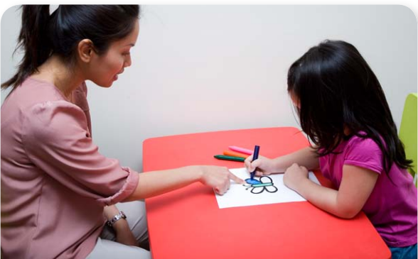
Encourage your child to stay within the lines